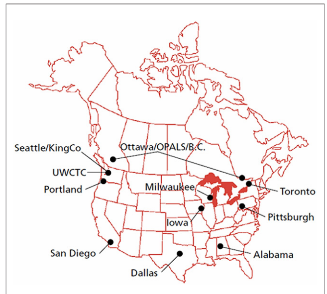
Figure 1 Map of Sites Contributing to the Resuscitation Outcomes Consortium Epistry Database

Manuscript received September 12, 2009; revised manuscript received November 6, 2009, accepted November 23, 2009.